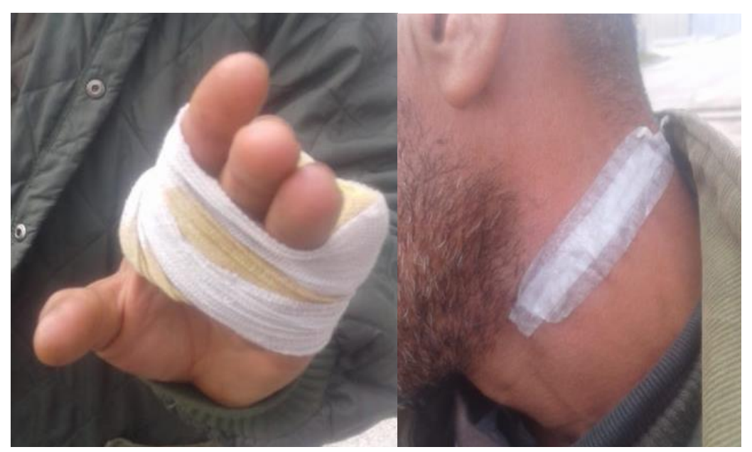
Hand and neck injury from being pushed down a slope by Croatian police into Korana river.

and physically harm them at the same time. Officers, regularly matching the description of Croatian Interventna forces, frequently use water courses to violently expel groups back into Bosnia's Una Sana Kanton. In these cases, people-in-transit report being pushed or kicked from the top of a hill, down into the bushes, and into the river (see <u>2.8</u>).