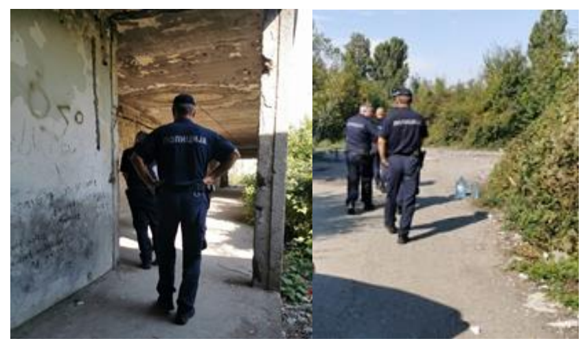
Serbian police making spot checks at the informal settlements in Šid.

Yet it would seem the tenure of such squat communities hangs among a balancing act of multiple factors. With winter coming and potential changes poised to come into force under the Commissariat for Refugees and Migration, the autonomy of informal settlements are perhaps considered a threat to the cogency of a state-run camp system, which is currently half empty. Yet, as reported by <a href="InfoMigrants">InfoMigrants</a> this September, shelter within one of Serbia's many official camp facilities represents its own form of entrapment, which many people living on the margins of Šid are also keen to avoid.