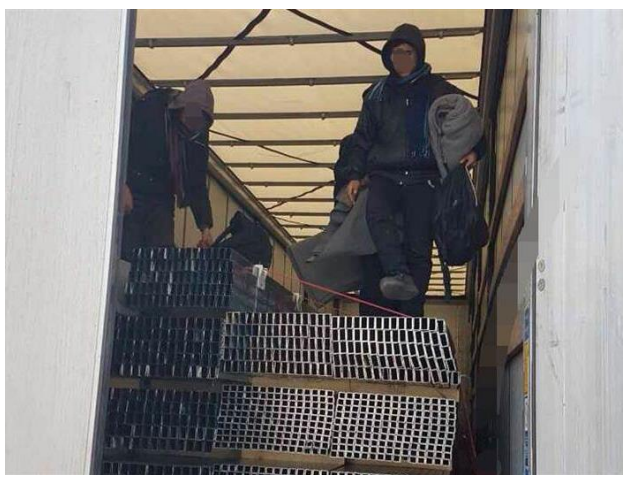
Transit group who attempted to cross the border at Zvornik, between BiH and SRB

One consequence of this, as covered in BVMN's <u>August Report</u> (pg. 14), is the use of vehicles for clandestine transit, which brings multiple threats into play. These include unbearable temperatures and oxygen levels, and the possibility of becoming fatally trapped. The volume of cross border vehicle transit was highlighted across the Balkan route this September, with a similar case that <u>N1 reported</u> in Zvornik ( BiH ). Given the complete lack of legal recourse to asylum and safe transit, riskier methods with larger amounts of people-in-transit involved, exacerbated by harsh winter conditions, are only set to increase across the next six months, when prolonged foot travel becomes almost impossible.