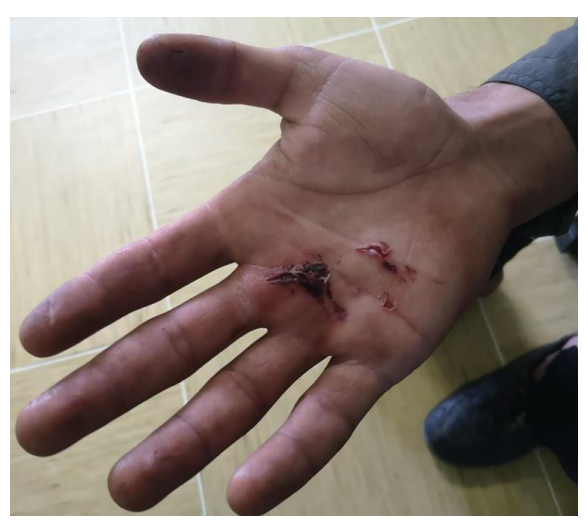
Dog bite photographed by ECA, 24th September.

Alongside direct attacks, police dogs have also been used by Hungarian officials at the train station in Kelebia ( HUN ) to search freight carriages and guard apprehended groups. In a <u>report from August</u>, the respondent described the intimidatory behaviour of the police officers handling the dogs which were guarding him, stating that: