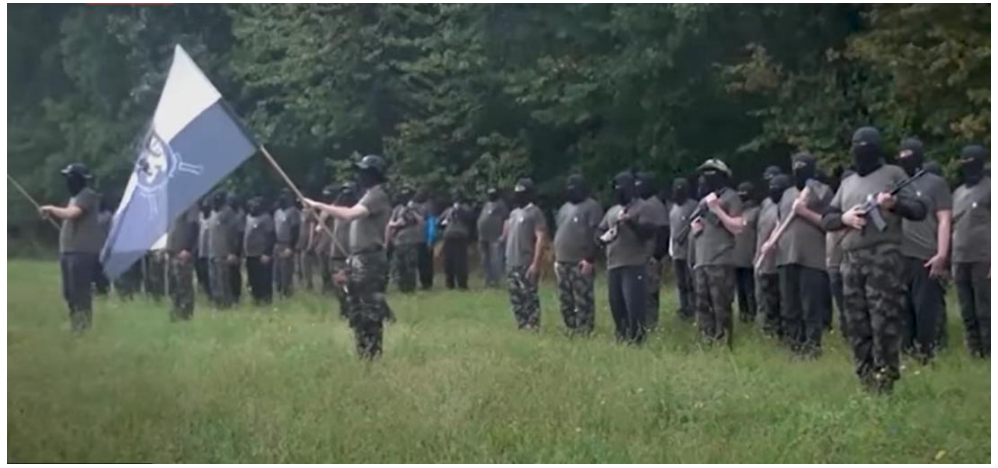
Still taken from an AP published video of right wing paramilitaries swearing an oath of allegiance near Maribor (SLO).

On September 17th the Associated Press <u>reported</u> on the alarming activities of a Slovenian para-military group called <u>"Stajerska Varda"</u>, operating along the border with Croatia. Members of the group are reportedly taking part in vigilante activities, apprehending people-in-transit who try to cross the border, and calling the police to push them back. Until now the groups' members have not been observed carrying out any violent actions, but their rise in numbers and presence on the border is deeply concerning. A <u>video</u> from October 2018 shows a large number of armed people taking an oath near Maribor, stating their intent to take border security into their own hands.