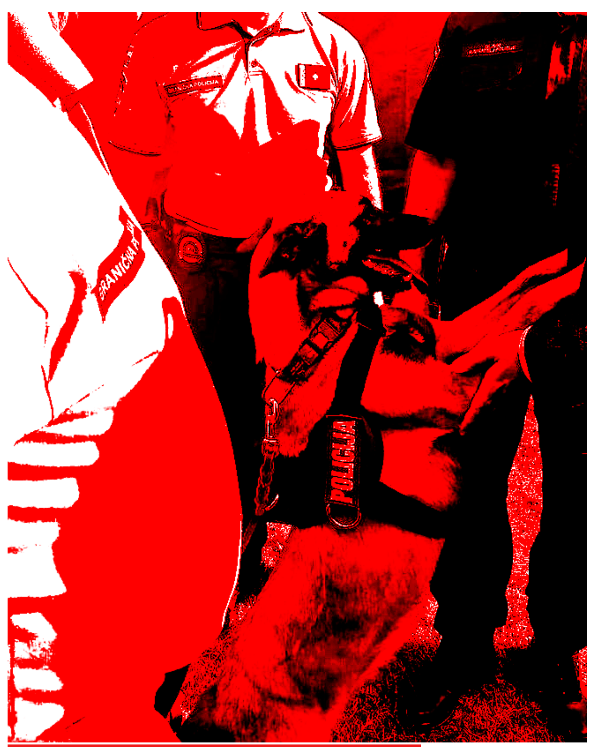
ILLEGAL PUSH-BACKS & BORDER VIOLENCE REPORTS BALKAN REGION SEPTEMBER 2019