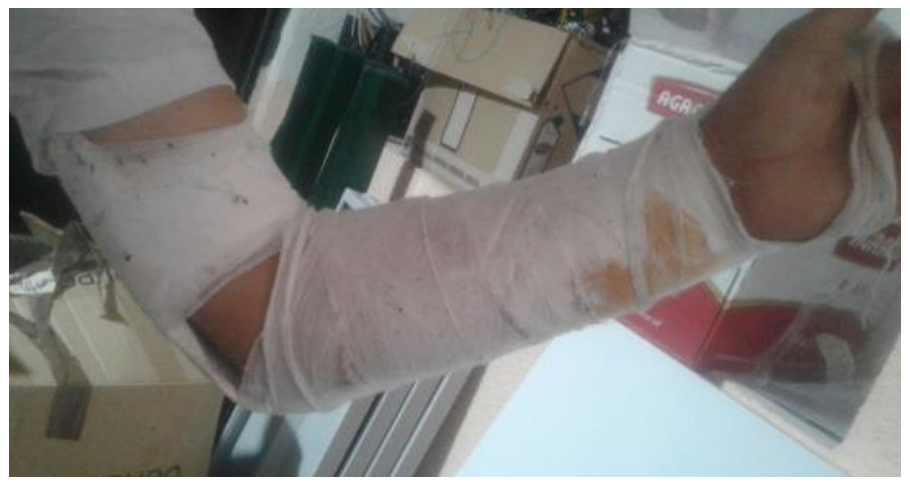
Photo of bandaged arm from dog bite and wrist splint used to treat fracture.

"The police did not say 'stop'. There were two dogs; one had a muzzle, the second didn't. The dogs made us fall on the ground. My friend protected his face with his arm and was bitten by the dog."