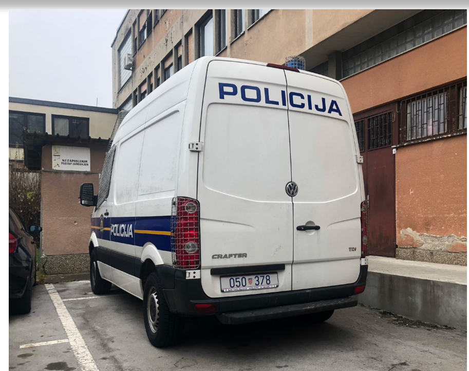
Croatian authorities are described as detaining groups as large as twenty in windowless vehicles which are driven back to push-back sites. The most common types of prisoner transport vehicles that the Croatian government uses are the Volkswagen Crafter, Mercedes Sprinter, and Ford Transit.

breach of international laws and norms. The Border Violence Monitoring Network believes that these cases, along with the other cases housed within our database, represent a violation of Article 3 of the ECHR on the grounds of cruel and inhumane treatment inside a police vehicle. The transportation of migrants and refugees from a police station inside extremely overcrowded police vehicles for extensive periods of time is not only abusive, but represents