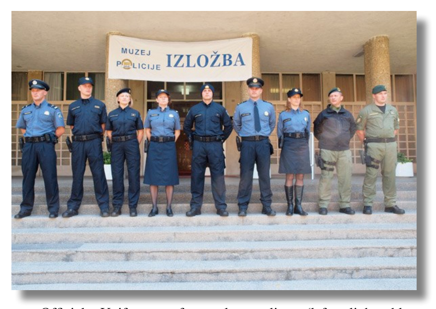
Official Uniforms of regular police (left; light blue shirt, dark blue pants), intervention police (dark blue/black uniform) and special police (khaki uniform)