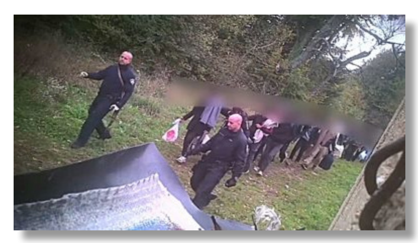
Intervention police during push-back operation in October 2018