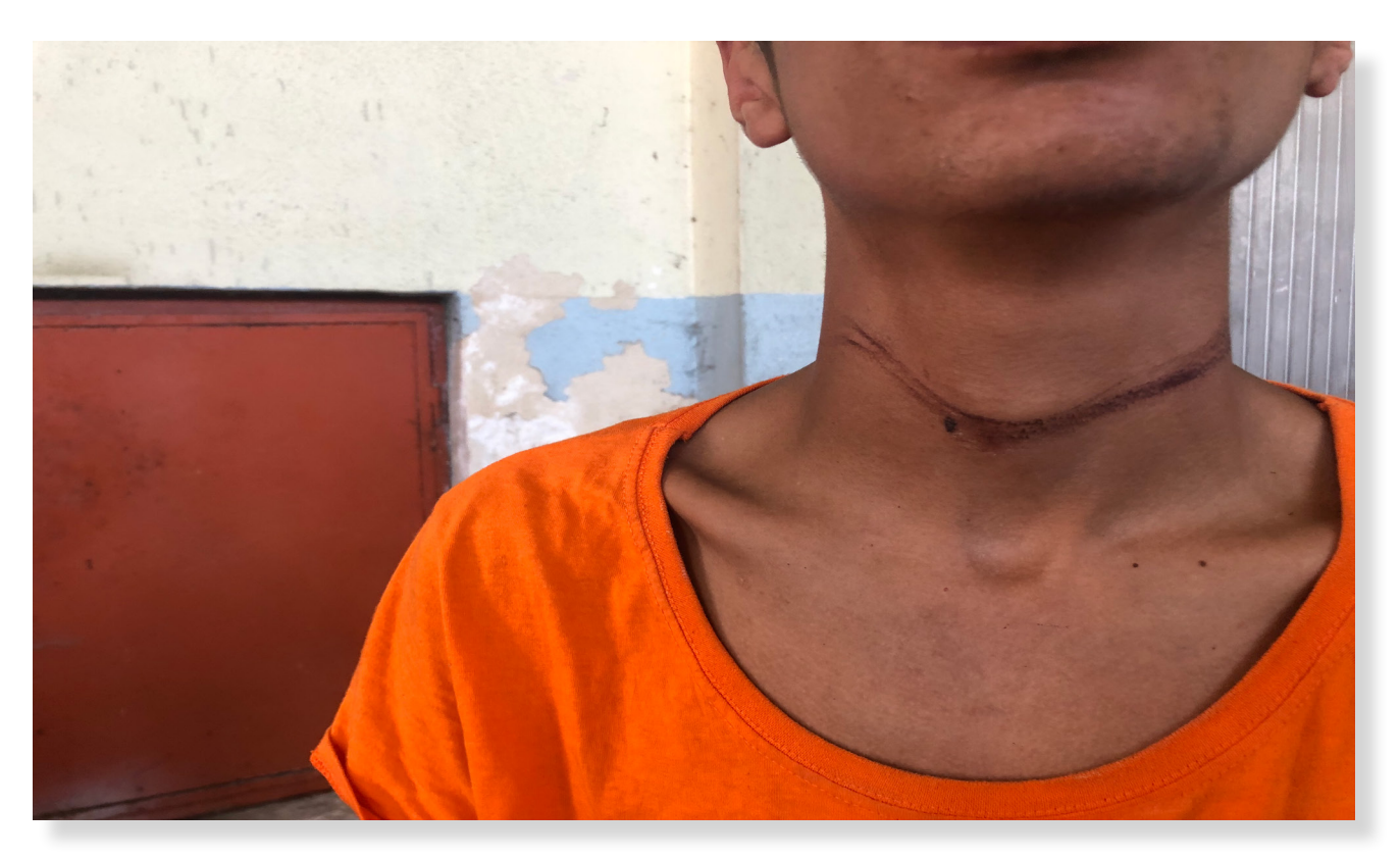
The scarred neck of an Algerian national in Velika Kladuša in August, 2019. The 18-year-old described being strangled by a Croatian police officer, who used his shirt as a sort of garot around his neckbefore, pushed back to BiH

The following section presents six fields of abuse observed throughout our case studies: the use of electric discharge weapons, forced undressings, the use of excessive and disproportionate force, threats or excessive force committed with firearms, detention with no basic facilities, and inhumane treatment inside of police vehicles. These six fields are first introduced with a brief legal framework and then are explained through several case studies and analyzed.