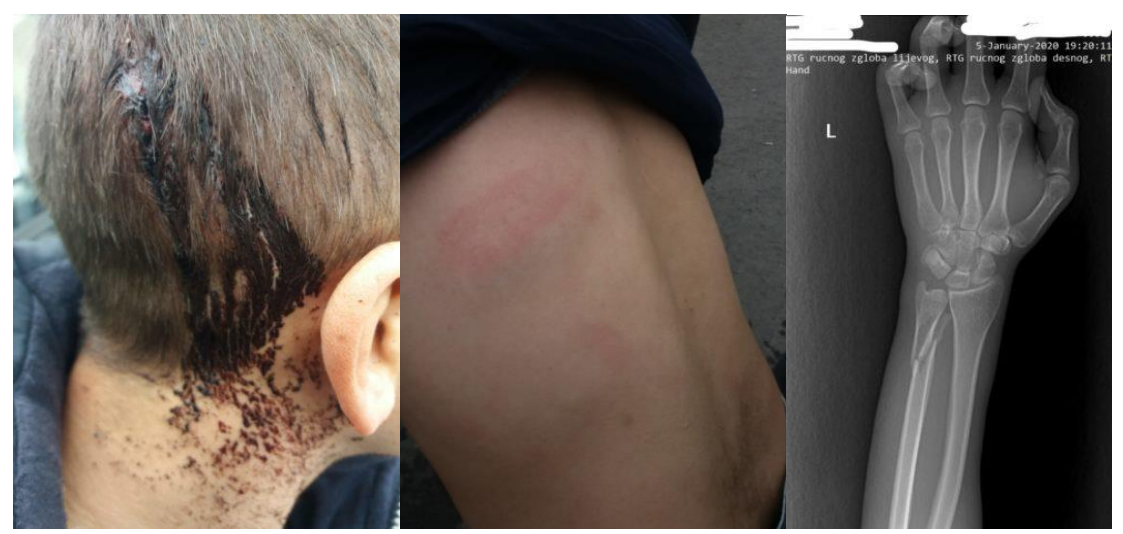
Left and Centre: Baton injuries from violent assault Right: Bone fracture

Over 80% of recorded pushback cases during January involved beating with hands, batons or kicking by Croatian police. These actions have been framed by two opposing narratives, while we often see pushbacks being denied by the Croatian authorities, at times these actions are also legitimised, such as, when former head <u>Kolinda Grabar-Kitarovic</u> suggested a "little bit of force is needed" in removing people from Croatia.