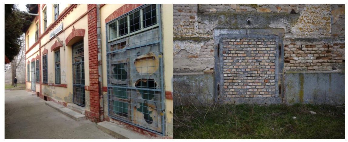
Left: Metal bars blocking access to Kanjiža Train Station. Right: Hayloft in entrance in Horgoš bricked up by local authorities in 2018 (Source: Collective Aid).

An average of 30 - 50 people continue to live in the vicinity of Horgoš and report receiving regular checks from the Commissariat for Refugees who make adhoc head counts. Nearby Kanjiža remains a hot spot for transit and pushed back families. The situation with local police repression remains dire, with continued harassment, theft of belongings and evictions. The abandoned train station in Kanjiža has been evicted permanently and metal bars were fixed at the windows and doors, an action that follows on from previous efforts to block access to squated buildings in the area in 2018.