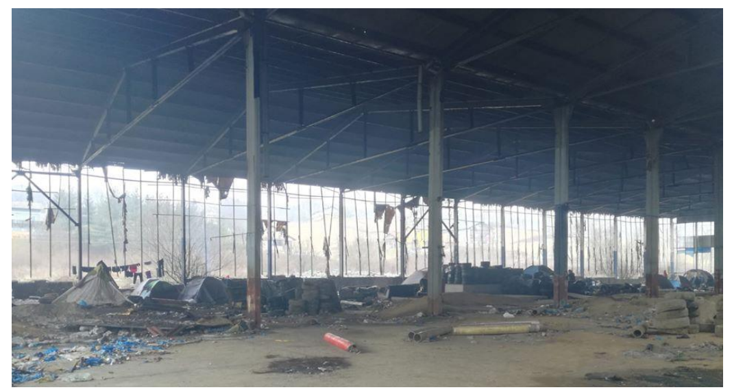
Factory close to Velika Kladusa where people are staying in tents