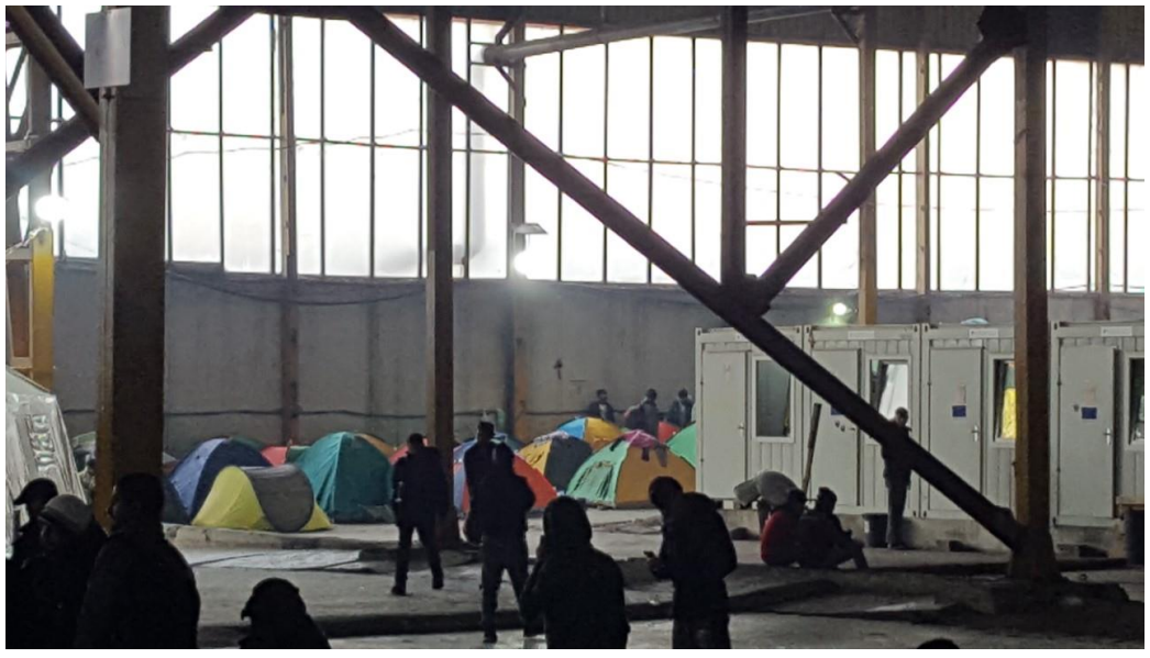
Light summer tents in Temporary Reception Centre Bira (Source: Anon).

Camps offer some approximation to accomodation, and for the fortunate they are a pathway to the minimal services available for minors and adults. But the support is not enough. Of the 124 unaccompanied minors in <u>Ušivak camp</u> in Sarajevo only 40 have their legally entitled social worker or temporary guardian. Meanwhile adults are regularly turned away by camps, denied access on the basis of capacity or because some nationalities are considered low priority. This fact is devastating for those who face the freezing winter months outside in a climate which does not discriminate. The story inside the camps is often no better, with those who do find space sleeping crowded into tents or in containers, typically with persons who they have no social or familial relationships with.