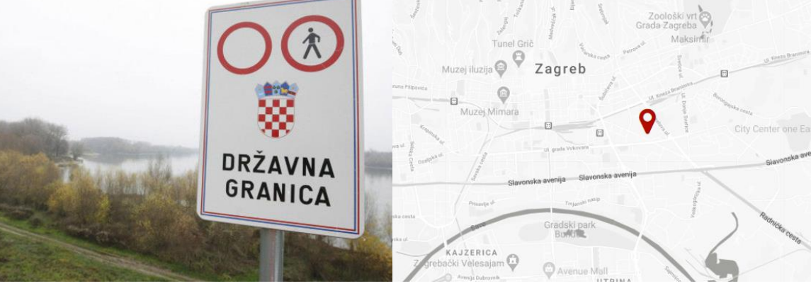
Left: Croatia's green border (Source:<u>CMS</u>).

'I am sorry, no asylum here. If you want asylum go to Zagreb, no asylum here in