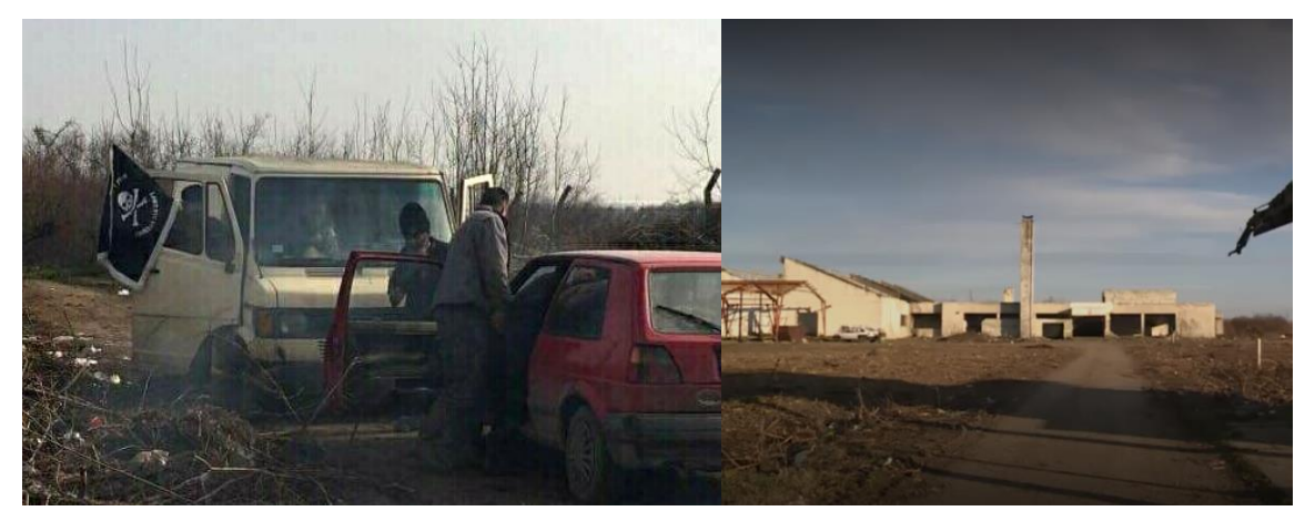
Perpetrating group and Chetnik flag Abandoned Gasrofrem site

These acts were followed up with further physical violence just days later, with one volunteer being struck with a flag pole. In an interview with <u>Balkan Insight</u>, NNK volunteers described the scene. "The [Sokoli] workers approached and started to put petrol on the plastic sheet," which was part of a tent with another volunteer still inside. Burning of tents and possessions by the police and municipality has been a regular occurrence since autumn 2019 and members of the offending group were open about their collaboration with local government, stating,