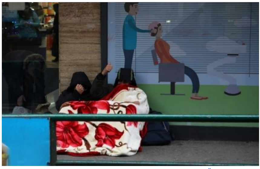
Transit groups sleeping rough in Sarajevo.

Practices like this have been increasing since November 2019, when serious cases of violence from BiH officials were reported in <u>an article from Are You Syrious </u> and regular forced removals to the <u>settlement of Vučjak</u> were taking place. The violence comes in parallel with the lack of asylum access, housing options and criminalisation of informal settlement. Local law enforcement must be held accountable, but it is clear this precarious situation is a product of EU border externalisation and must be read alongside Brussels' regional strategy for non-member states.