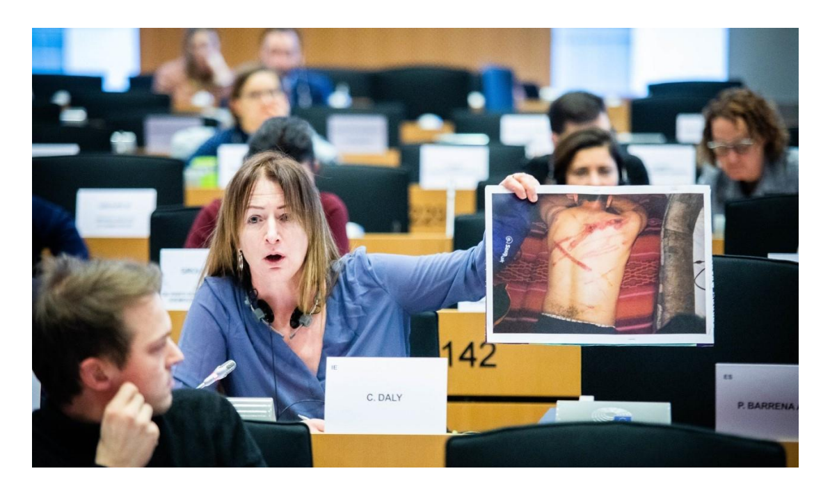
MEP's hold aloft pictures of injuries from Croatian pushbacks

Striking a similar tone, German MEP Dietmar Köster said,