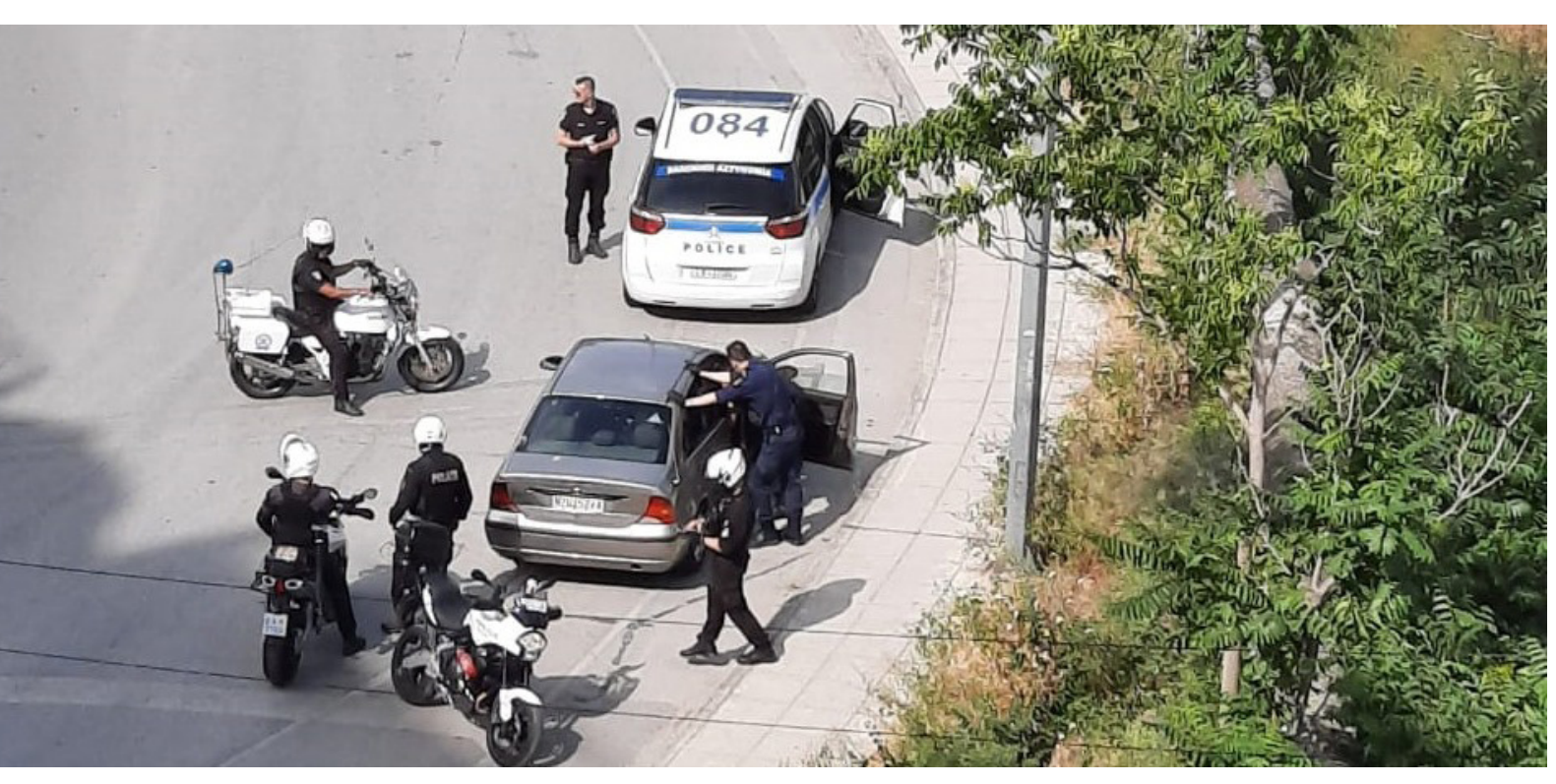
POLICE ON THE SCENE IN THESSALONIKI, BLOCKING ROADS DURING THE PUSHBACK

The climate in Greece, never warm for NGOs, has turned positively icy over the last month. In a bid to make the state a less attractive destination for people-on-the-move, the government has clamped down on groups working in camps, requiring them to register on a central database controlled by the Ministry of Migration. Whilst this has been touted as a move for greater transparency and coordination, the reality is starkly different. Refugee Support Aegean and Terres des Hommes Hellas have criticised the requirements for stigmatising solidarity work and creating "exorbitant costs" for government approved audits. The Expert Council on NGO Law also found the new legislation would require substantial revision to be in line with European standards.