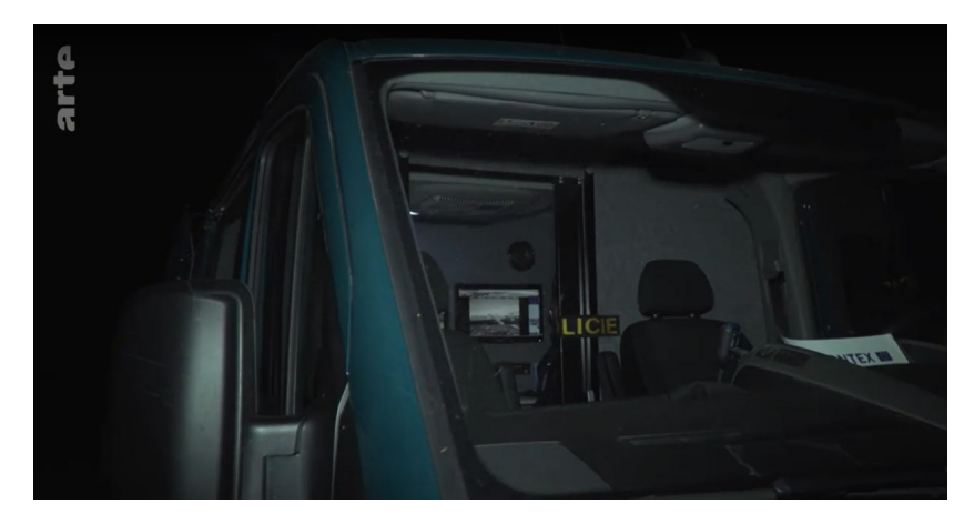
SURVEILLANCE VAN USED FOR SPOTTING TRANSIT GROUPS AT NIGHT FROM OUTSIDE & INSIDE

equipment define Frontex's aggressive approach to stemming the movement of the transit communities from Northern Greece, impacting people primarily from the Middle East and Maghreb regions. This is particularly pertinent at a time when the <u>UN's Special Rapporteur on Contemporary Forms of Racism</u> is investigating the intersection of new technologies and racial descrimination. Reports gathered by BVMN highlight the way extensive weaponry and technical equipment at Frontex's disposal streamlines illegal pushback operations, negating the asylum rights of people-on-the-move. These violations deeply contrast the outward image of the agency as upholding fundamental rights.