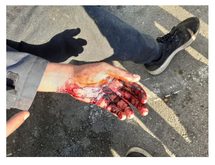
PUSHBACK INJURIES CAUSED DURING THE EMBEZZLEMENT OF THESE FUNDS

"THE COMMISSION IS AWARD-ING €6.8 MILLION TO CROATIA TO HELP REINFORCE BORDER MANAGEMENT AT THE EU'S EXTERNAL BORDERS, IN FULL RESPECT OF EU RULES. (...) A MONITORING MECHANISM WILL BE PUT IN PLACE TO ENSURE THAT ALL MEASURES APPLIED AT THE EU EXTERNAL BORDERS ARE PROPORTIONATE AND ARE IN FULL COMPLIANCE WITH FUNDAMENTAL RIGHTS AND EU ASYLUM LAWS"