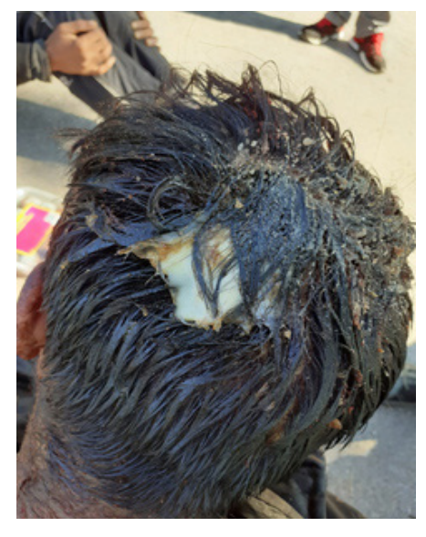
FOOD SMOTHERED INTO WOUNDS ON A MANS HEAD

weapon used to emphasise the risk of crossing state borders. While knives are latent in most cases, the knowledge of their prior use - alongside other tools like guns and tasers forms part of the imaginary of those facing contact with law enforcement in Croatia. Parallel to the recent knife attacks Amnesty and BVMN also spoke to a group affected by an incident where police used rifle butts to strike their heads till they bled (see 4.3). Officers compounded the attack by rubbing ketchup and mayonnaise into the wounds, serving to denigrate the injured bodies. These reports contribute to the growing understanding of pushbacks as acts of state sanctioned torture, a lens through which BVMN has analysed Croatian border practice before, both around the use of firearms and a myriad of other practices.