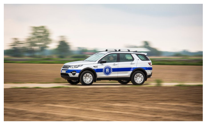
FRONTEX VEHICLE USED IN ALBANIAN MISSION

ment to detect them. Procedures relating to the use of force also appear to have been ramped up with interviewees (see 5.1) maintaining they were threatened with firearms, a development in line with new regulation allowing Frontex personnel to bear arms. Firearms, response vehicles and surveillance