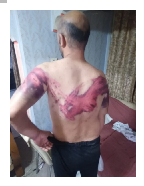
BRUISING INCURRED FROM BATON STRIKES

and the <u>increased militarisation</u> of the area. Network member <u>Josoor</u> is observing first hand the fallout of these removals and the protracted struggle of those now recovering in Turkey. People who braved the land border in recent weeks were met with a wall of abhorrent violence on the part of Greek officials. Several respondents reported to volunteers the use of electric discharge weapons and attacks with batons. Meanwhile, one transit group shares how they were thrown into the Evros river with their hands cuffed with zip ties (see <u>6.6</u>) - a potentially fatal tactic which has been observed in a <u>previous case</u>. While