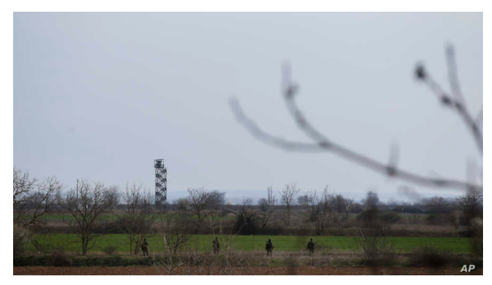
SECTION OF THE FENCE ALREADY CONSTRUCTED BY KASTANIES, GREECE

BVMN published reports covering the pushback of 237 people from Greece to Turkey last month. The trends in crossings shifted during June, with a growing number of people attempting passage across the Aegean sea from the coast around Izmir (TUR). This has been reflected in the evidence gathered of pushbacks from respondents stranded on the Turkish side and their testimonies of the violence while on Greek land and especially territorial waters. Part of the reason for this changing of routes may be connected to the efforts by Athens to shore up existing fortification at the Evros land border, with more fencing