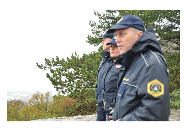
JOINT PATROL OF SLOVENIAN AND ITALIAN POLICE

The Italian state, counters criticism of these removals, claiming they remain legal while the "readmitted migrant is not deprived of the possibility of applying for asylum, as Slovenia is part of the European context", something Italian legal experts contest. These hurried procedures spiked in May when as many as 30 people appear to have been returned to Slovenia in just a single day.