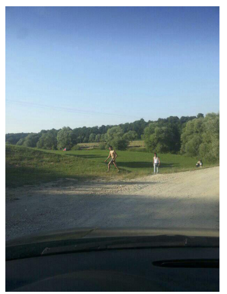
PEOPLE STRIPPED BY THE CROATIAN POLICE - NEAR TRZAC, BIH

of thousands of people removed illegally from neighbouring Croatia, a process occuring night and day at the direction of the Croatian Ministry of Interior (MUP). Network member No Name Kitchen works with people in this area and heard from some of those whose homes face out onto the Croatian border. Most recently in the Trzac area, locals have reported a high volume of incidents where groups approached them for clothes, having been stripped down to their underwear by Croatian police: