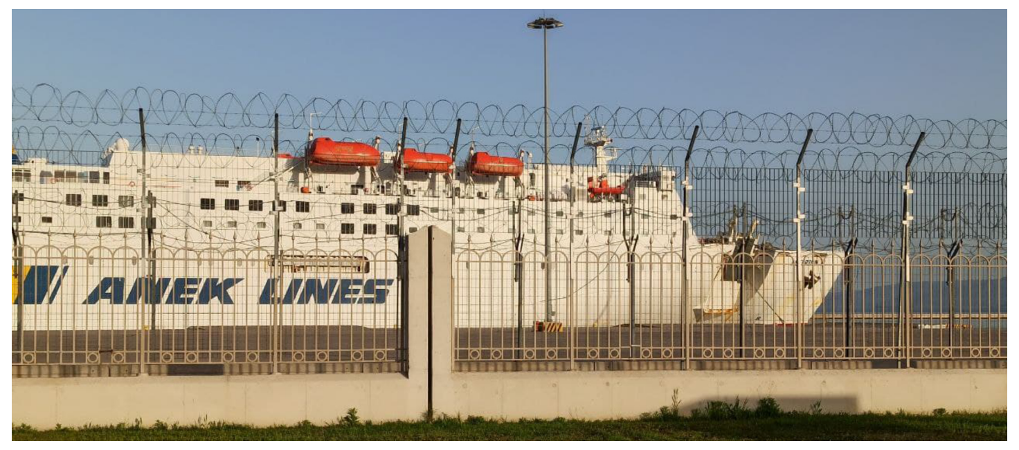
Ilmage of patras port, where many people on the move go to "game" to try to cross the adriatic into italy. In the last months, the port has been a location for violent pushbacks and police brutality.