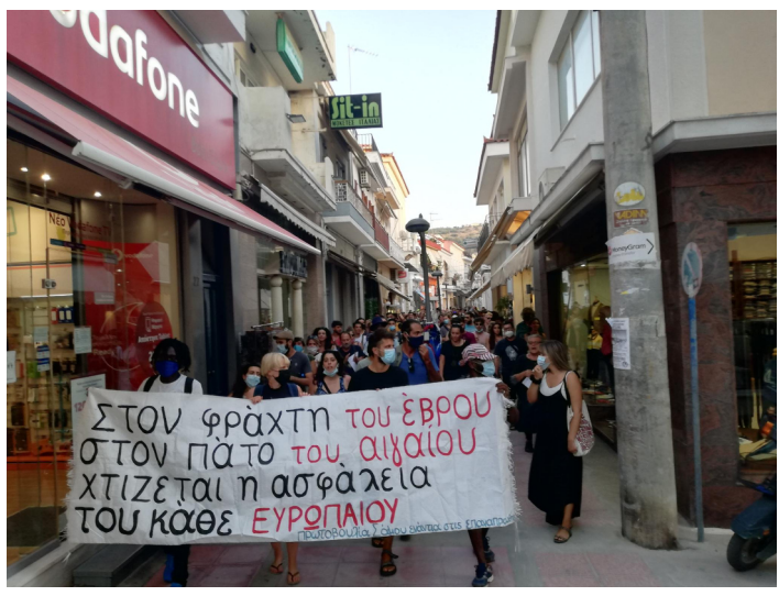
images of a protest against pushbacks that took place on Friday, 25th June in Samos