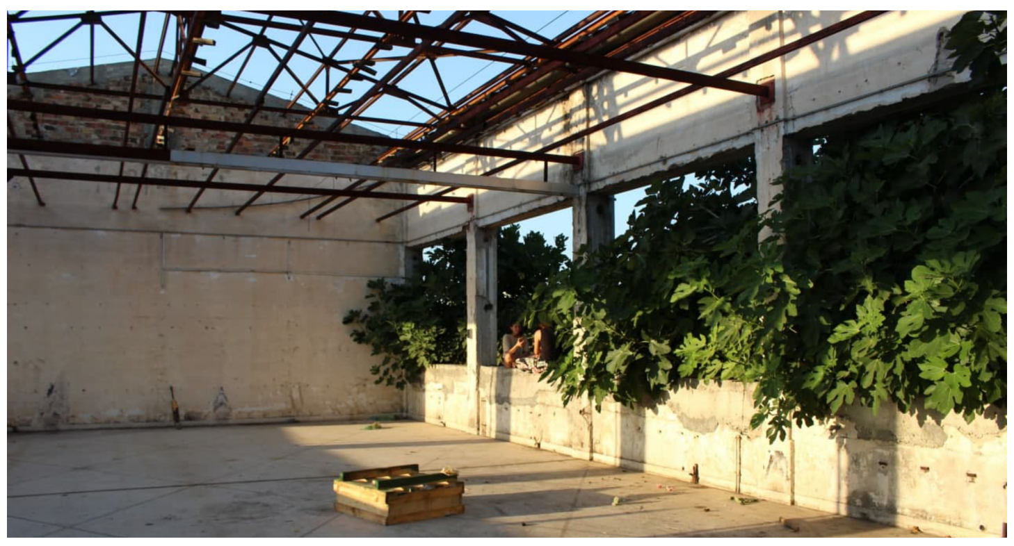
A look into one of the squats in Patras port, where many people on the move looking to board ships going to Italy live