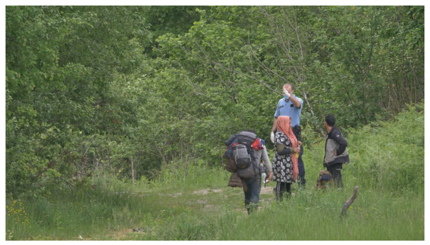
Still from footage of a family being pushed back from Croatia to Bosnia-Herzegovina, which was published by a coalition of media outlets on the 23rd June 2021