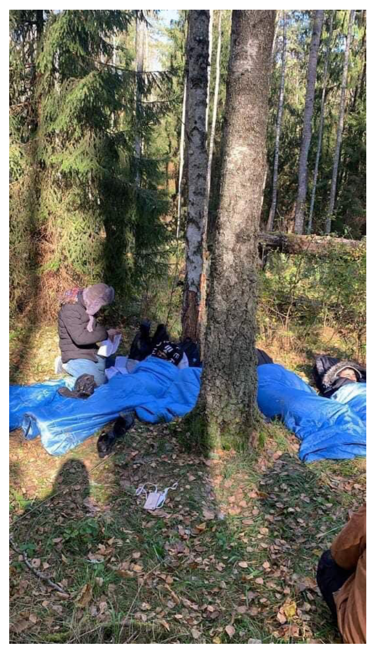
Family stuck in the woods on the Belarus-Poland border

When people reach Poland, they continue to face dangerous conditions, including the increasingly cold temperatures, that have already cost lives. A three kilometer swath from the border into the country has been declared a "zone of emergency" into which humanitarian aid workers, journalists and medics may not enter. This cuts off people-on-the-move as well as hampering the movement of local Polish people in this area. Local people have started a "green light initiative" that allows people who have crossed the border to identify homes where they can find warm clothes or a warm meal, though locals cannot do more without risk to themselves. Polish people across the country have been protesting the regime's hardline stance. Yet as winter sets in, the violence of the border is likely to claim more lives unless substantive access to asylum and emmediate material assistance are introduced.