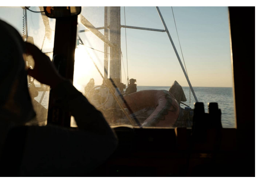
Monitoring vessel on the Aegean

As a result of the countless reports of systematic atrocities committed against people-on-the-move by Greek and European authorities, the European Commission and numerous civil society groups have demanded that Greece implement an independent monitoring mechanism at its borders. The Greek government, however, continues to adopt laws that guarantee them total control of the sea and inhibit any civil society groups from monitoring human rights violations.