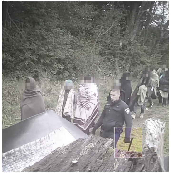
Footage dating back to 2018 showing Interventna police carrying out pushbacks in Lohovo

<u>Croatian government's response</u> appears to be little more than window-dressing. Rather than addressing the issue of collective expulsions head on, Croatian President Zoran Milanović was quick to emphasize that the pushbacks filmed by Lighthouse and its partners were an "isolated case", contradicting years of evidence gathered by BVMN and other human rights groups, focusing instead on the "tough job" done by the police who should not be "stigmatized". This fits into Croatia's long-held strategy to deny that pushbacks are even taking place. The willingness of the Croatian government to maintain this narrative was recently illustrated when Croatia <u>blocked the publication</u> of a report by the Committee on the Prevention of Torture and Inhuman or Degrading Treatment or Punishment of the Council of Europe (CPT). The report likely provides further evidence of Croatia's mistreatment of people-on-themove at its border. By denying publication, Croatia is the only European Union member country to have done so in ten years.