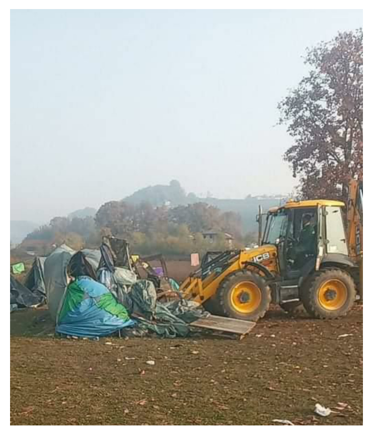
Bulldozers destroy tents in the field

evicting those living in informal settlements, such as tent structures and abandoned selfcontained buildings. People-on-the-move will be moved to the camp, in a remote rural area far from infrastructure, where they will be forced to live in inhuman conditions, especially during the winter when temperatures will drop below zero.