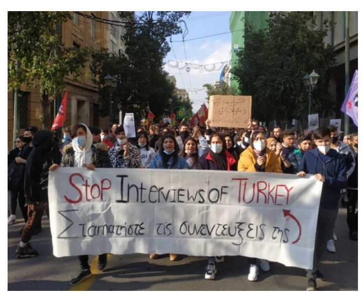
Image description: demonstration against pushbacks and border violence (Athens)

Pushbacks are illegal, and involve torture and the risk of death. In the Evros region, people are detained without food or water, robbed of all personal belongings, humiliated, and brutally beaten before being forced across the Evros river to Turkey. People are also taken from far inside the territory, abducted by police from the streets or camps, only to be pushed-back to Turkey. These violations are enacted by the Greek police and military forces, Frontex (The European Border and Coast Guard Agency), local vigilantes, and other gangs recruited by the Greek police. In the Aegean, help is often refused to boats in distress; boats are intentionally damaged and pulled back towards the Turkish coast by the Hellenic Coast Guard (HCG) and Frontex. People who manage to reach the Greek islands and express their intention to apply for asylum are forcefully brought back to the open sea, made to board life rafts without engines and left to drift into Turkish waters by the HCG...We will always stand with the people struggling for freedom, dignity, and solidarity in a world devastated by war, exploitation, and oppression."