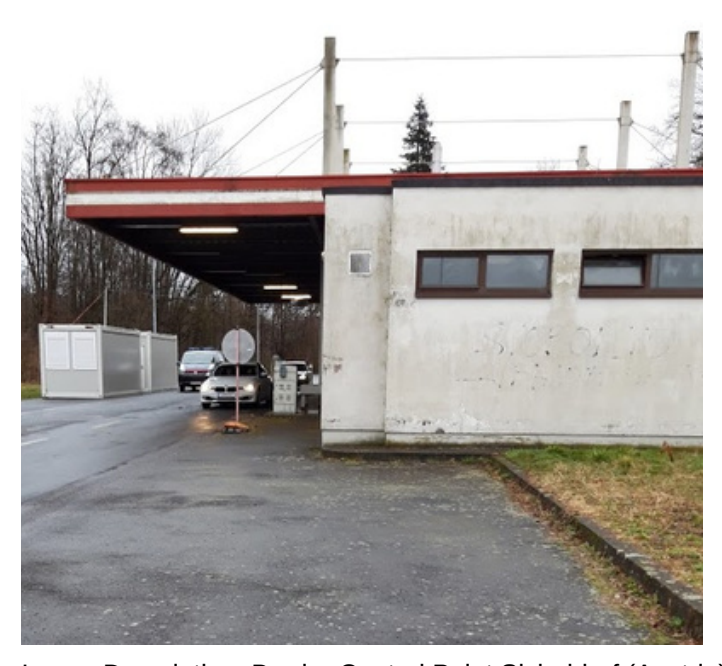
Image Description: Border Control Point Sicheldorf (Austria)

"This case is not only for myself or my group. This one is for the many other people who suffered and keep suffering from police and border control injustice. This one is for the many people who couldn't get their voices to be heard. This one is for the people who got their hopes completely demolished. This one is for justice".