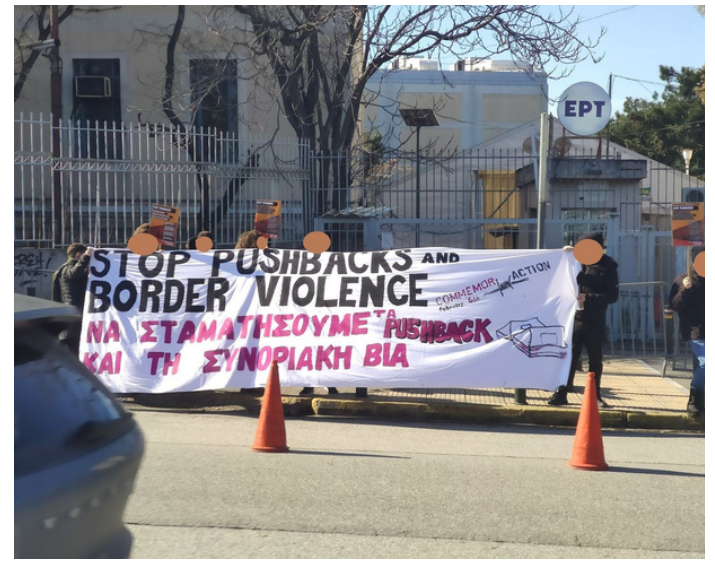
Image description: intervention outside Greek Asylum Service (Athens)

The Open Assembly Against Pushbacks and Border Violence is an assembly of collectives and individuals that stand in solidarity with all people struggling for freedom, rights, and dignity in a world devastated by war, exploitation, and oppression. We are organizing a collective struggle in Athens against systemic violent pushbacks carried out by the Greek State, and other forms of border and state violence targeting people-on-the-move.