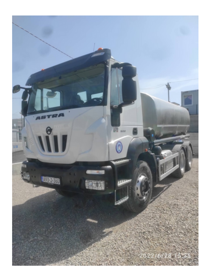
Image Description: cistern truck delivering water at Lipa camp