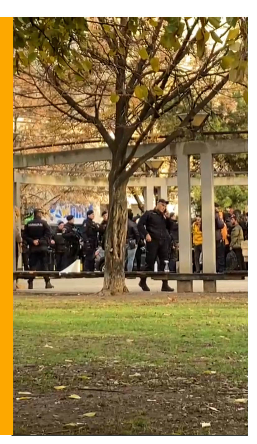
Image description: Police raid in one of the Belgrade parks this month.

On November 24th, there was a shooting between people belonging to smuggling networks in Horgoš, a popular transit town for people on the move around 30 kilometres from Subotica. Six people on the move were hospitalised and several detained after the shooting. Unlike previous confrontations between groups who facilitate border crossings, this incident was highly visible as it took place in Horgoš town centre which caused immediate and intense backlash from Serbian locals and state authorities. By November 27th, the Serbian authorities had completely demolished and evicted two of the largest informal settlements in Horgoš. More than 600 people were forcefully taken to government camps located in the south of Serbia. On the same days, Serbian police officers also gathered most people on the move present in the parks around the bus station in Belgrade - a regular spot for people transiting through the city - and transported them to official camps.