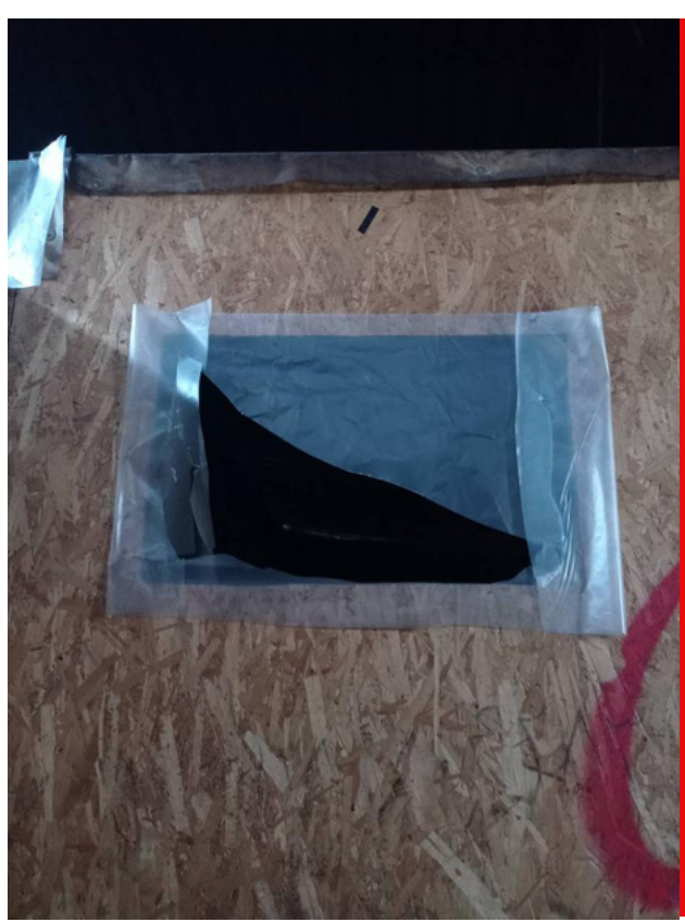
Image description: one of the rooms after the eviction. Image source: NNK

Image description: one of the windows from the informal settlement - the plastic covering it was slashed during the eviction. Image source: NNK