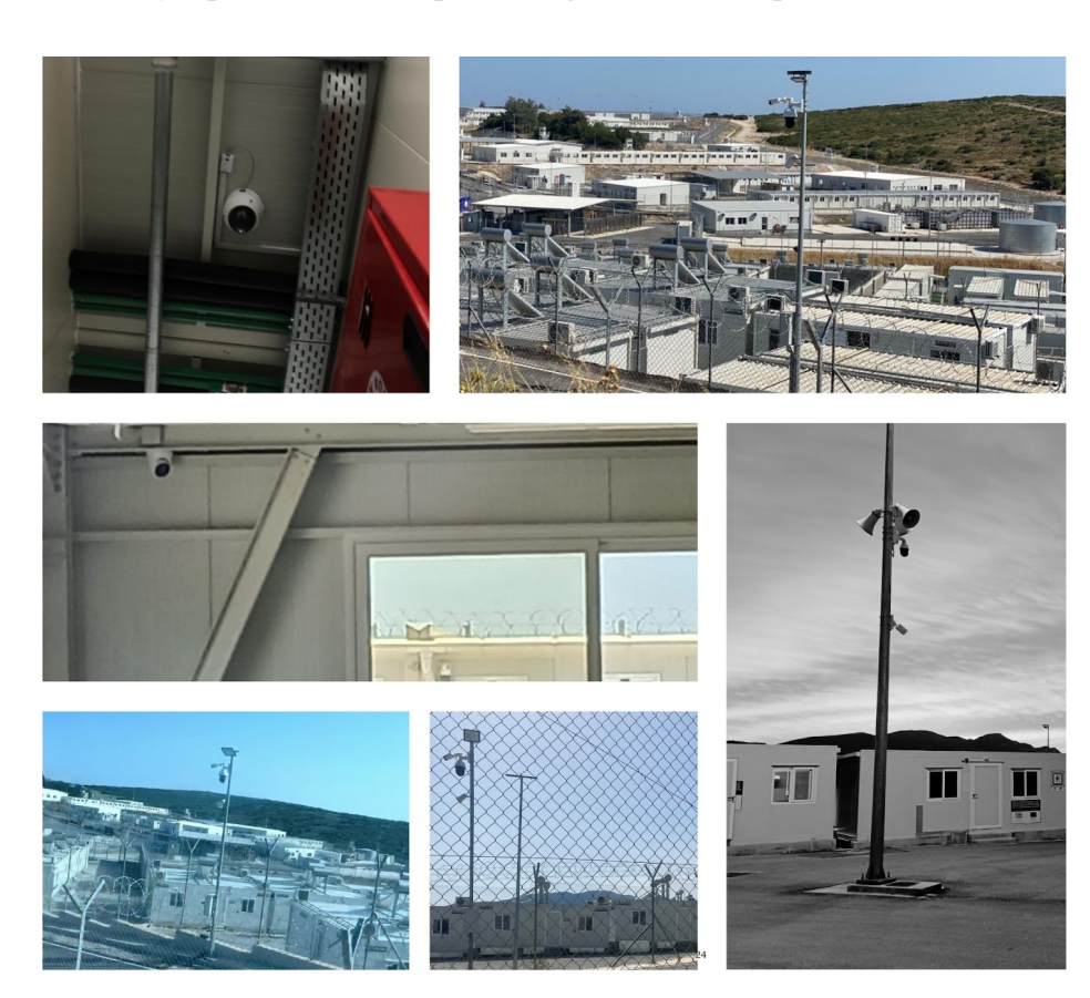
<u>Title</u>: Photos of CCTV cameras in the Samos CCAC, including spaces used for accommodation (see centre left).

Centaur deploys CCTV cameras and aerial drones to collect image, video, and, according to the Ministry, audio data in the CCAC.<sup>54</sup> Centaur likely uses AI motion analytics, rather than behavioural analytics algorithm (due to conflicting information on the Ministry's website this is unclear), that monitors data, and claims to flag movements, such as potentially aggressive or hostile actions, to alert the authorities.<sup>55</sup> Camera feeds are accessed remotely in the control room of the Ministry in Athens.<sup>56</sup> At least three Greek and two Israeli companies are involved in the system: ESA Security, Space Hellas, Adaptit, ViiSights<sup>57</sup> and Octopus.<sup>58</sup>