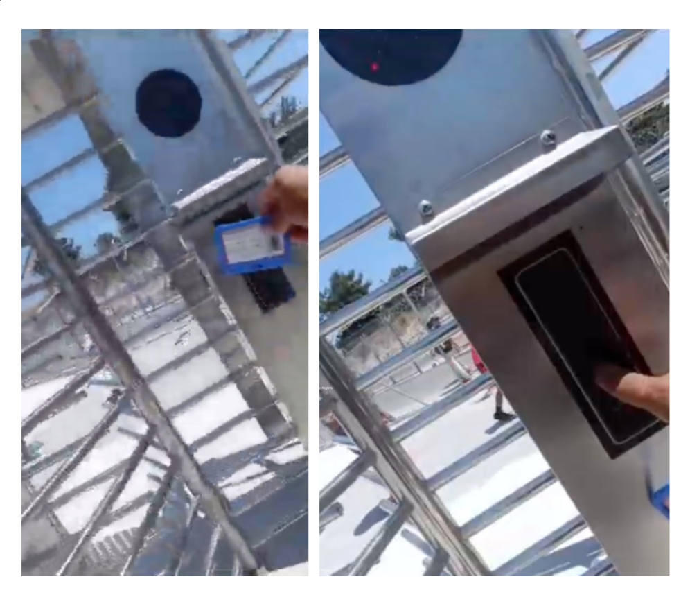
<u>Title</u>: Screenshots from a video sent by an asylum seeker to I Have Rights in August 2024 showing the procedure to enter the Samos CCAC (left: 1-scanning of the person's biometric card, right: 2-scanning of their fingerprint).

Hyperion uses biometric data to control entry and exit from the CCAC. People on the move are required to scan their fingerprints and biometric ID card to enter, exit and sometimes to move through the facility. In contrast, of the NGO workers interviewed, none were required to provide their fingerprints to enter the facility. Instead the authorities allowed them to enter and exit by checking their national (non-biometric) ID cards.