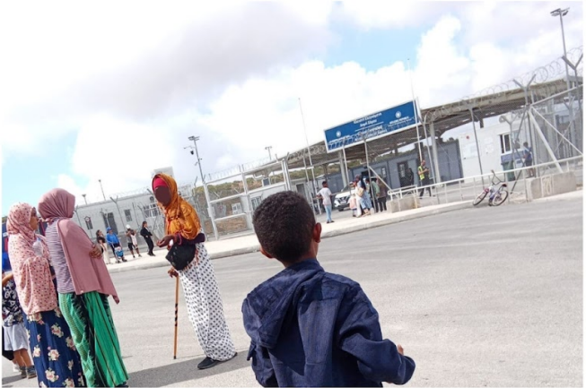
<u>Title</u>: Photos from the outside fences of the Samos CCAC with CCTV video surveillance and fingerprint entrance structure.