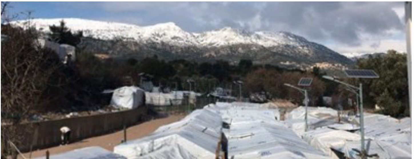
Vial Camp, Chios

located in an elevated and exposed position. Vial Camp floods regularly, carrying with it uncollected trash and further attracting pests to people’s shelters. This was coupled with electricity and water shortages throughout January; those living in Vial camp have had to cope with a severe lack of access to heating and running water during this harsh weather. The past months have been increasingly difficult for the 500–800 people who have been notified of the decision or second rejection of their asylum application. These applicants, as analysed in a recent AYS article , are “no longer entitled to material support from the RIC, including space to shelter, cash assistance and food”, which has “resulted in forced evictions and mass clearances of sections of the camp”.