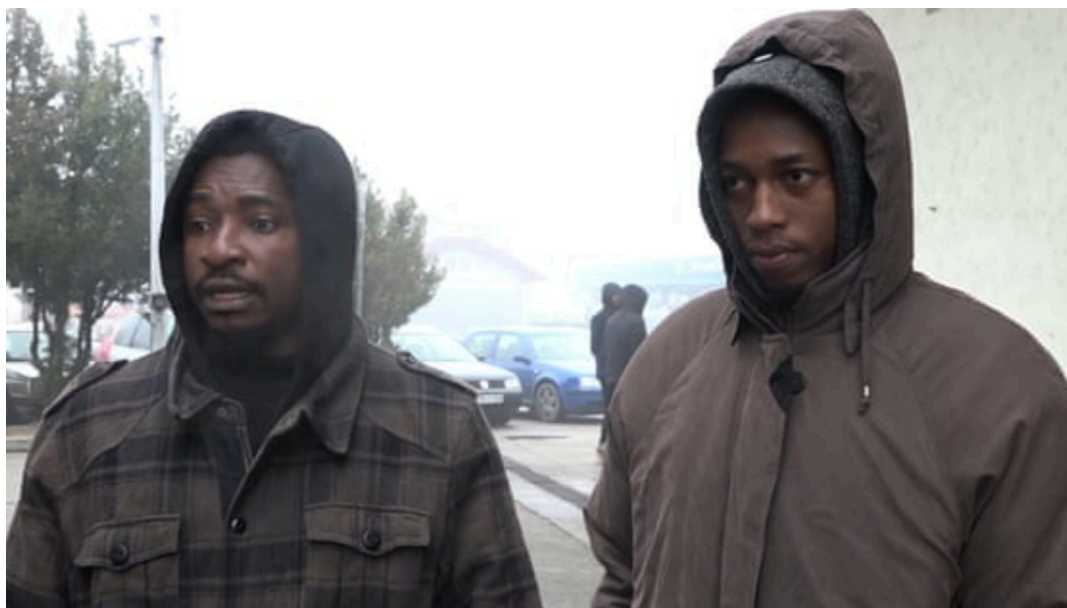
Nigerian students pushed back from Croatia

documented the removal of a group to Serbia , despite the fact that they initially travelled into Croatia from BiH. While these incidents remain outliers when compared to the level of direct pushbacks carried out at borders, they do pose insights into the possible tactics used by authorities to disrupt transit and/or carry out faster returns, irrespective of the destination.