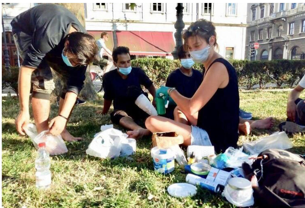
Treating wounds of arrivals in Trieste

brought testimonies of activists in Bihać and Zagreb, denouncing the violence carried out by the Croatian police and the increased sum of European funds turned towards border control .