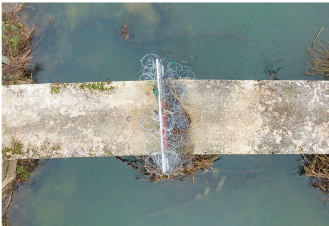
Bridge on the HR/BiH border

Hopes are that this new court ruling will assist in the struggle of ending such practices and forging safe and legalised routes to the EU. Yet despite the court's decision, BVMN has continued to record pushbacks initiated by Italian authorities (see 4.1 & 4.2 ), who are persistently mobilising the readmissions procedure, which generally marks the first step in a process of violent chain refoulement.