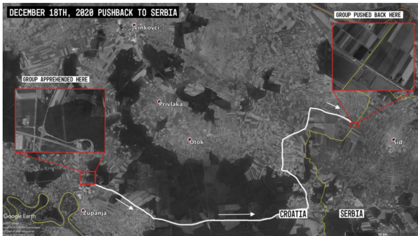
Visual route of a recent pushback at Tovarnik