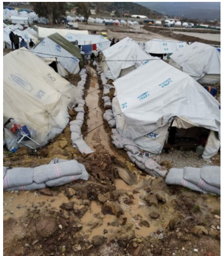
Moria 2.0, Lesbos

It is unclear if any further steps have been taken by the Greek authorities to ensure the safety and wellbeing of those living in Moria 2.0, and as winter weather continues to pound the camp, the situation grows only more dire . Symptoms of lead poisoning are often difficult to diagnose, but the adverse health effects can be irreversible, including (but not limited to) brain and nerve damage, which is particularly severe for children while their bodies are in developmental states. The severity of symptoms increases with prolonged exposure. The right to health, encompassing protection from harmful substances/environmental conditions is recognized under international law and the Greek Constitution. Steps must be taken that this right be secured for people-on-the-move on Lesbos.