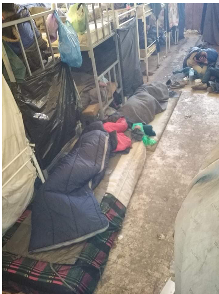
People sleeping on the floor in Sombor

While people-on-the-move sleeping in abandoned houses or train wagons have slightly better means to shelter from the cold, they still live in a precarious situation with a lack of access to hygiene facilities, medical care, or food support. Moreover there was another swathe of large-scale squat evictions in January, affecting locations in Subotica (close to the Hungarian border), as well as Majdan (close to Romania). Around 200 people on the move were forcefully transported to the South of Serbia. As seen in previous evictions, authorities came in the