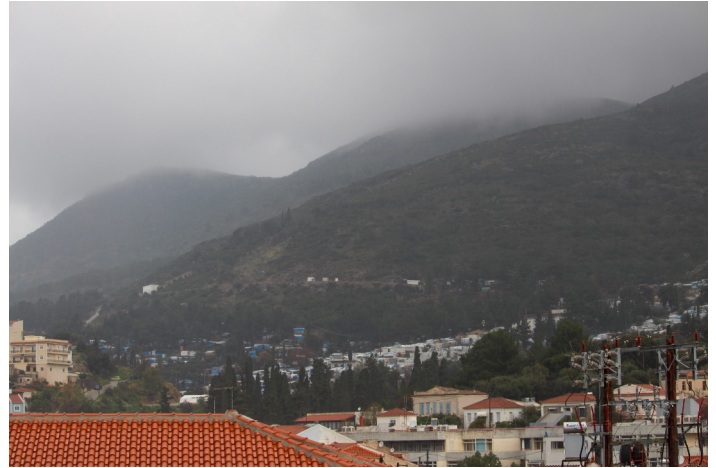
Vathy Camp, Samos

Similarly in Chios, where over 2000 people live in Vial camp, the temperatures dropped to -5°C. The bitterness is felt harshly by Vial camp’s residents as the structures are