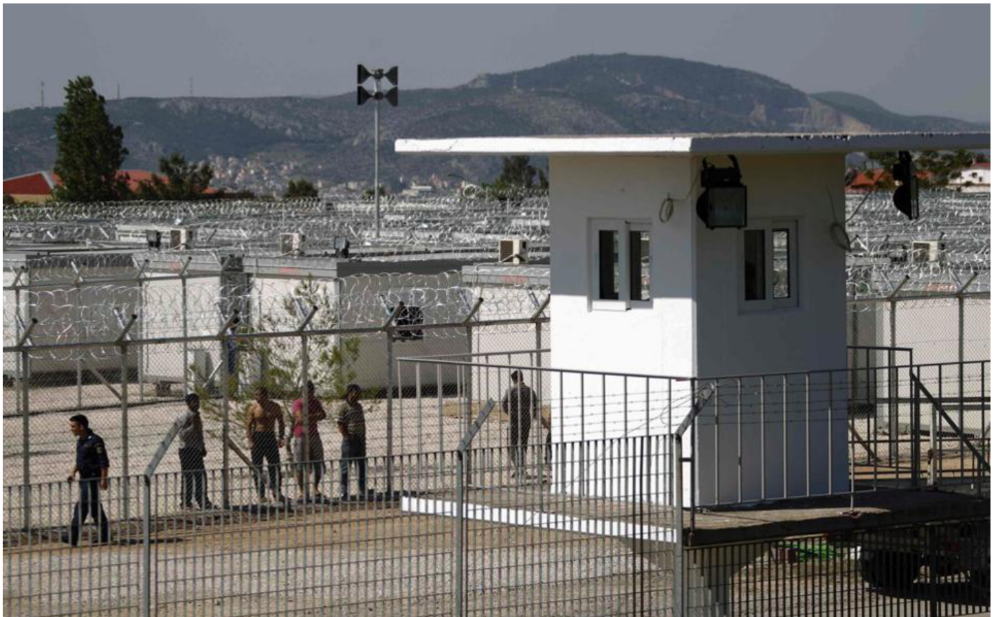
Detainees in Amygdaleza

With thousands languishing in a state of ‘permanent impermanence’, suicide and self-harm are also now endemic in PDCs. In cases dating back to 2012 , detainees have attempted suicide by drinking detergent and jumping off buildings , while one person also swallowed razor blades . There are some rays of light, however. At present, international observers are still granted access to PDCs where they can bring attention to, and hopefully check, these abuses. The question is: how long will it last?