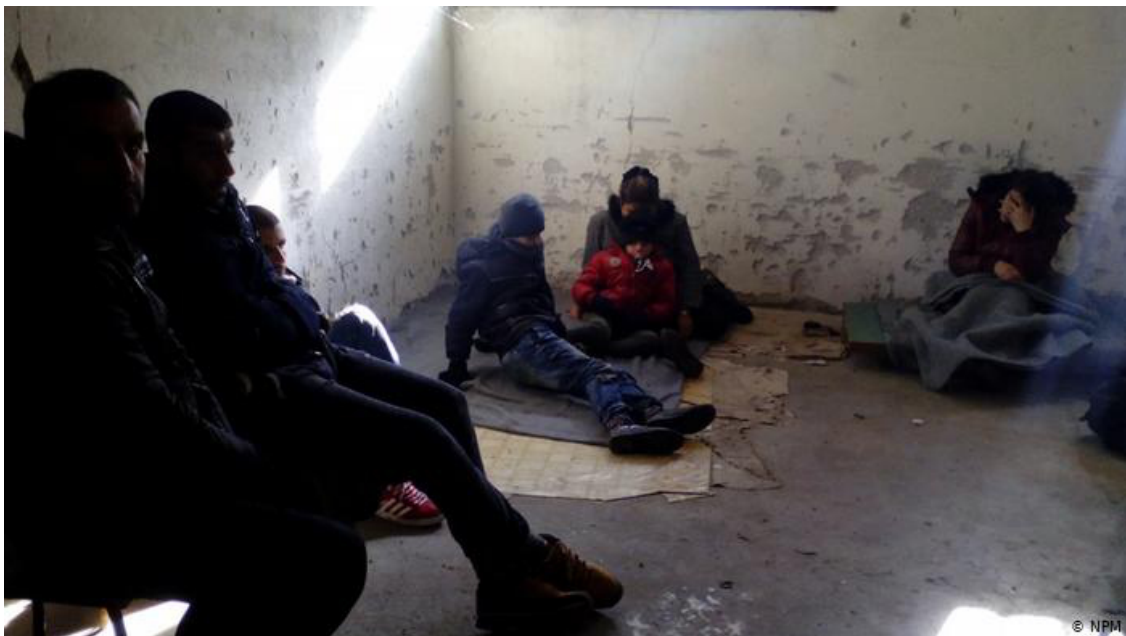
Photo of conditions in Gradina Police Station, Serbia

Notable present day examples of this practice include pushbacks from Serbia to North Macedonia. Cases of this, which peaked during the initial outbreak of COVID-19, affected people similarly registered within accommodation centres ( Tutin and Preševo ). Like the Afghani applicants favoured by the recent Constitutional Court Ruling, the groups were removed by Serbian authorities in a van, and in these cases subject to excessive force. Within this context of ongoing violations, the new ruling has particular relevance, and marks one step towards justice for those subject to illegal cross-border removals.