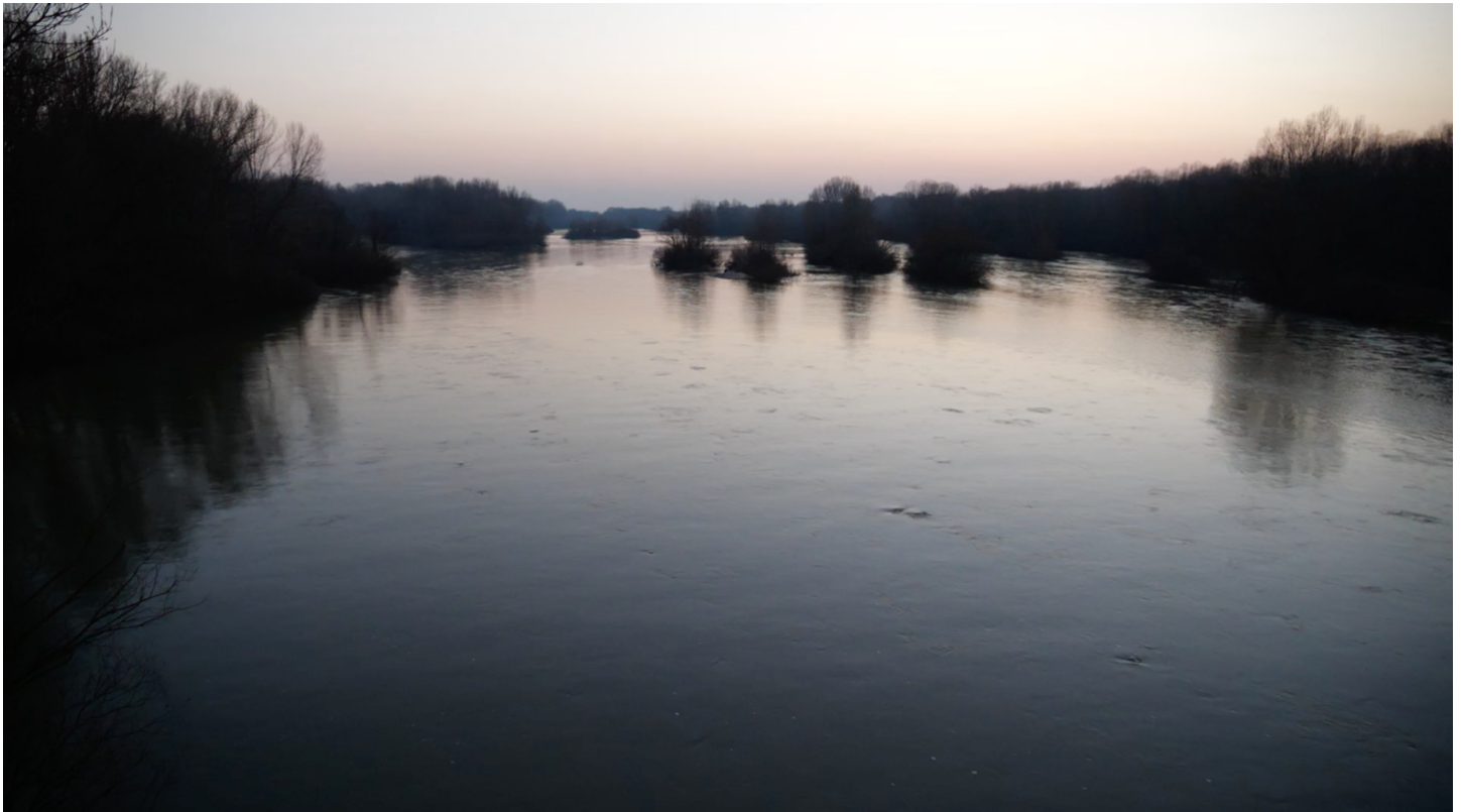
Ardas River where it converges with the Evros/Meriç

form of hybrid border violence that explicitly incorporates the river ecology itself’.