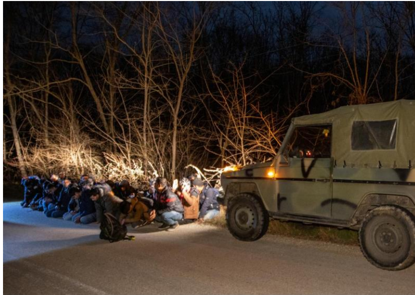
Large groups captured by GRK military in March

For those who have been documenting border practices in the region, these events reflect a continuation of established trends. Testimonies collected by BVMN on the GRK-TUR border detailing inhumane detention methods , boat removals at night , and violence by masked perpetrators, while already commonplace in the previous eight months, have proliferated during the last month. A case shared in March (see 5.2 ) described how at the Greek bank of the Evros river: