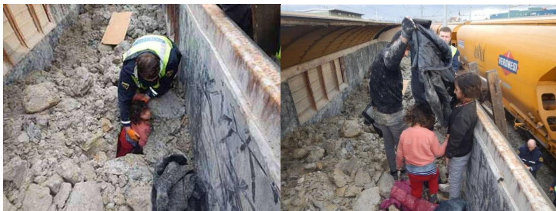
Photographs taken by Slovenian police on the scene

The respondent was travelling with his wife and five year old daughter when the train carriages were searched by Slovenian authorities in Dobova. Officers described as “ Special Police ” climbed atop the train carriages with several dogs and located the group, who were hiding under a deposit of clay. The danger of being trapped under this mass is a reminder of the risks people are forced to take in order to reach safe sanctuary. The search carried out by the officers is also reminiscent of the controls used at train stations at Gevgelija (MNK) and Kelebia (HUN), showing the consistent controls people encounter along the route, and the dangers they must take to bypass them.