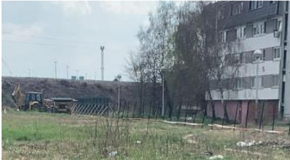
Construction of the fence around the asylum centre in Porin

On March 17th the Porin Centre for asylum seekers in Zagreb (HR) was fenced off to restrict those inside from moving freely. This decision was framed as a measure to prevent the spread of COVID-19, however, the population was not informed of the construction of the fence and had no time to prepare with relevant health supplies and protective equipment such as masks, gloves and sanitiser.